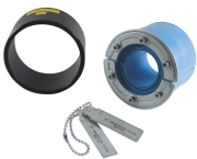
RS W Ex kit

For detailed information, please visit roxtec.com .